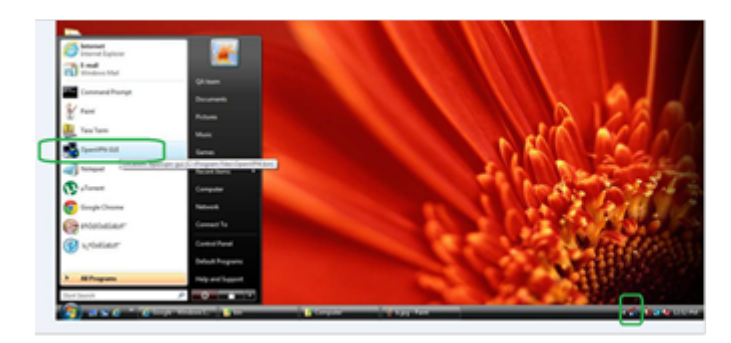
Figure 4. The OpenVPN icon displays in the Windows taskbar.

1. Launch the OpenVPN application with administrator privileges.