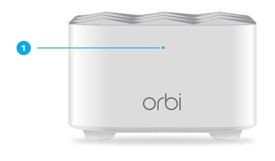
Figure 1. Orbi router front and back views

The following figures shows the Orbi router hardware features.