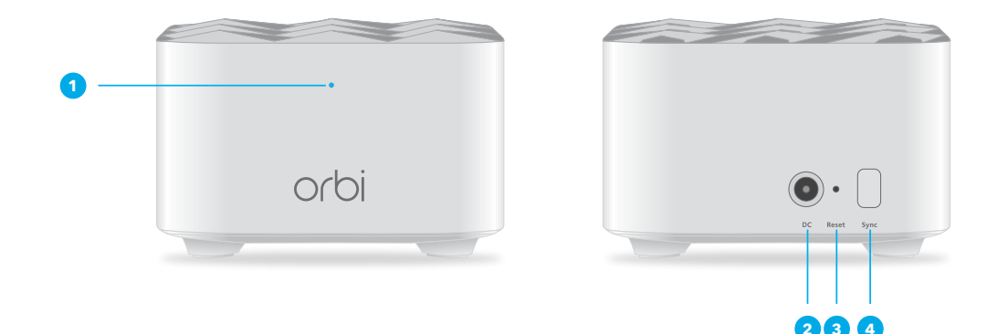
Figure 2. Orbi satellite front and back views

The following figures shows the Orbi satellite hardware features.