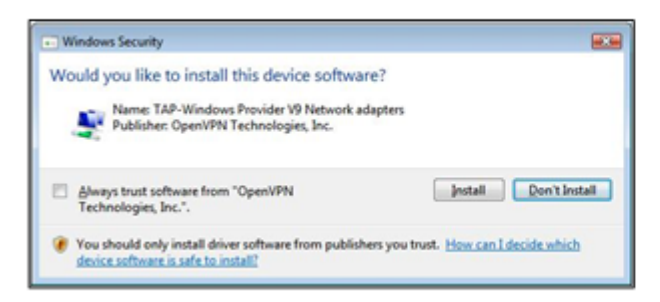
Figure 3. A Windows Security window opens.